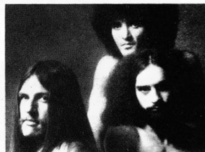
GRAND FUNK RAILROAD

Mark, Don & Mel have taken in a new member to the group—he's Craig Frost, who's their new keyboardman. We don't know whether it's the addition of Craig or the fact that—for the first time—Mark, Don & Mel have complete control over their music, but Funk seems to have opened up to many new sources of inspiration. Believe it or not, the world's most popular hard rock group even has a hint of country music on their newest.