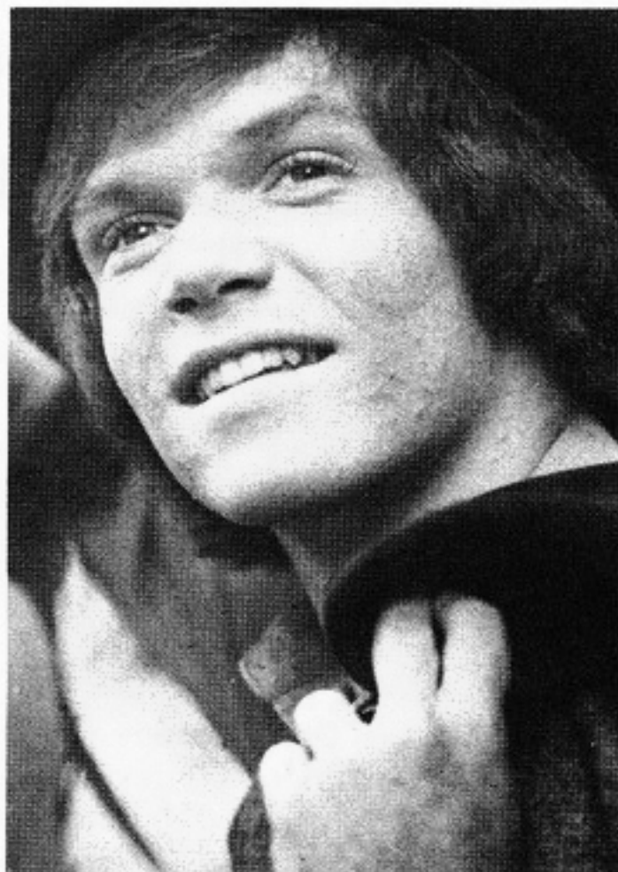
Mitch Vogel will cut a record soon.

GROUP SCOOP: Poor JOHN MARK of MARK/ALMOND —after an encounter with clothes-ripping groupies—went to Hawaii with JOE COCKER , fell out of a tree and will probably lose the ring-finger of his left hand... MITCH VOGEL , of "Bonanza" fame plus too many others to mention, is playing dates with his group, THE SUNDOWNERS , getting in shape to record the group's first album... THE JACKSON FIVE are off on an 8 city concert tour of Europe, beginning in London with a Royal Command Performance... MICHAEL is getting so much taller, RANDY 's getting cuter (what a smile!) and the rest of the boys are as gorgeous as ever... UK star DAVID BOWIE 's tour-of-America entourage is traveling by bus—he refuses to fly!... NEIL YOUNG 's finished his bio-film "Journey Through The Past"... The soundtrack includes CROSBY, STILLS & NASH goodies plus some unreleased BUFFALO SPRINGFIELD ... THE RASPBERRIES are touring the U.S. with THE HOLLIES and the turn outs have been fabulous... MELANIE and her back-up group are on a concert tour of England... Ditto for THREE DOG NIGHT ... 29-year-old MICK JAGGER has reportedly announced he'll retire from the personal appearance trail when he hits 33... THE MOODY BLUES U.S. tour starts in Virginia and winds up at that famous Long Beach (Cal.) Arena... RAY MANZAREK of the DOORS has bought a 23-acre ranch in Hawaii and now his own volcano. SHORT TAKES: ROGER DAVIS who stars as