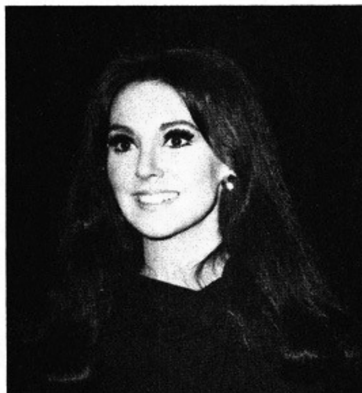
Malicious rumors are driving Marlo mad!

MARLO THOMAS has been plagued by a crank caller and crank rumor spreader. The nut contacts newspapers and wire services informing them that Marlo has been injured in a car crash or married. A recent item had her wed to HERB GARDNER . The police have been alerted because Marlo is really terrified. Wouldn't you be?