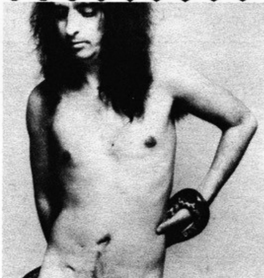
2. The far-out Alice Cooper!