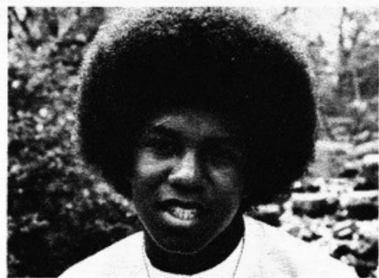
1. It's Jermaine Jackson — natch!