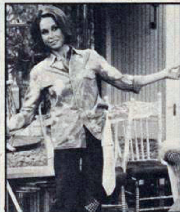
MARY TYLER MOORE