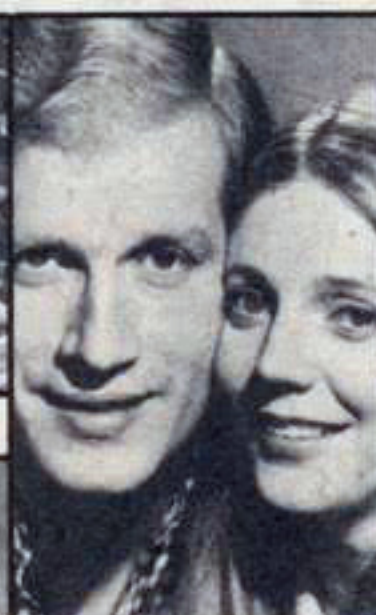
ABOVE: KEN HOWARD, BLYTHE DANNER—"Adams Rib."