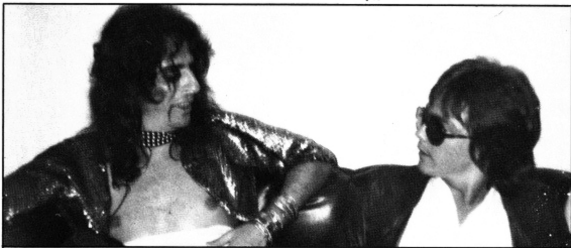
IS DAVID HEADED toward Alice Cooper's weird ways—off and on stage?

Everyone changes—even David Cassidy! Did he change for better or for worse? And can you love him, even though he's different?