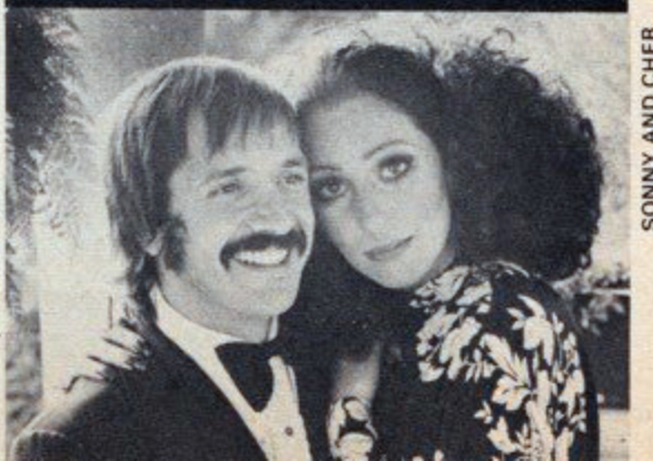
SONNY AND CHER