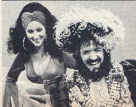
SONNY & CHER