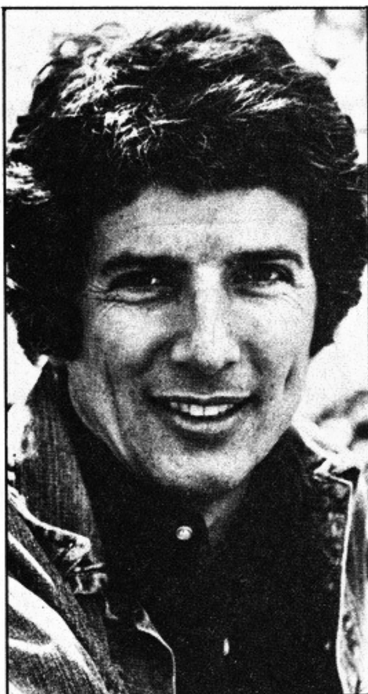
NOW THAT you've seen Bert Convy on "Partridge" and "Snoop Sisters," you may be hearing him sing soon!!

a possible television series based on the John Wayne movie, The Cowboys . It would be the first all-teen Western on the air, and we'll be sure to let you know what happens with this pilot.