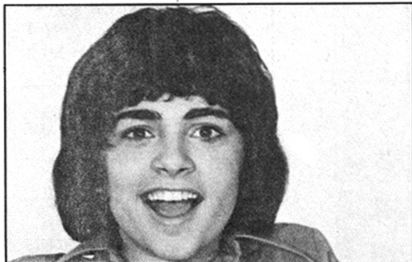
"Me! A teen idol!" Tony DeFranco would never have guessed a year ago that he and his family would be stars!