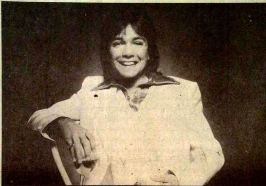
DAVID CASSIDY: "It's a unique experience for me going into the studio now. Things are really getting loose, but the sides are getting better and better."

that we'd better have special piping here, and things put in there and I looked down at my hand and suddenly I had an estimate for 2,300 dollars."