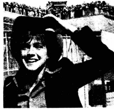
The idol . . . keeping his hat on.