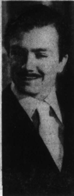
David Cassidy ... I was all used up