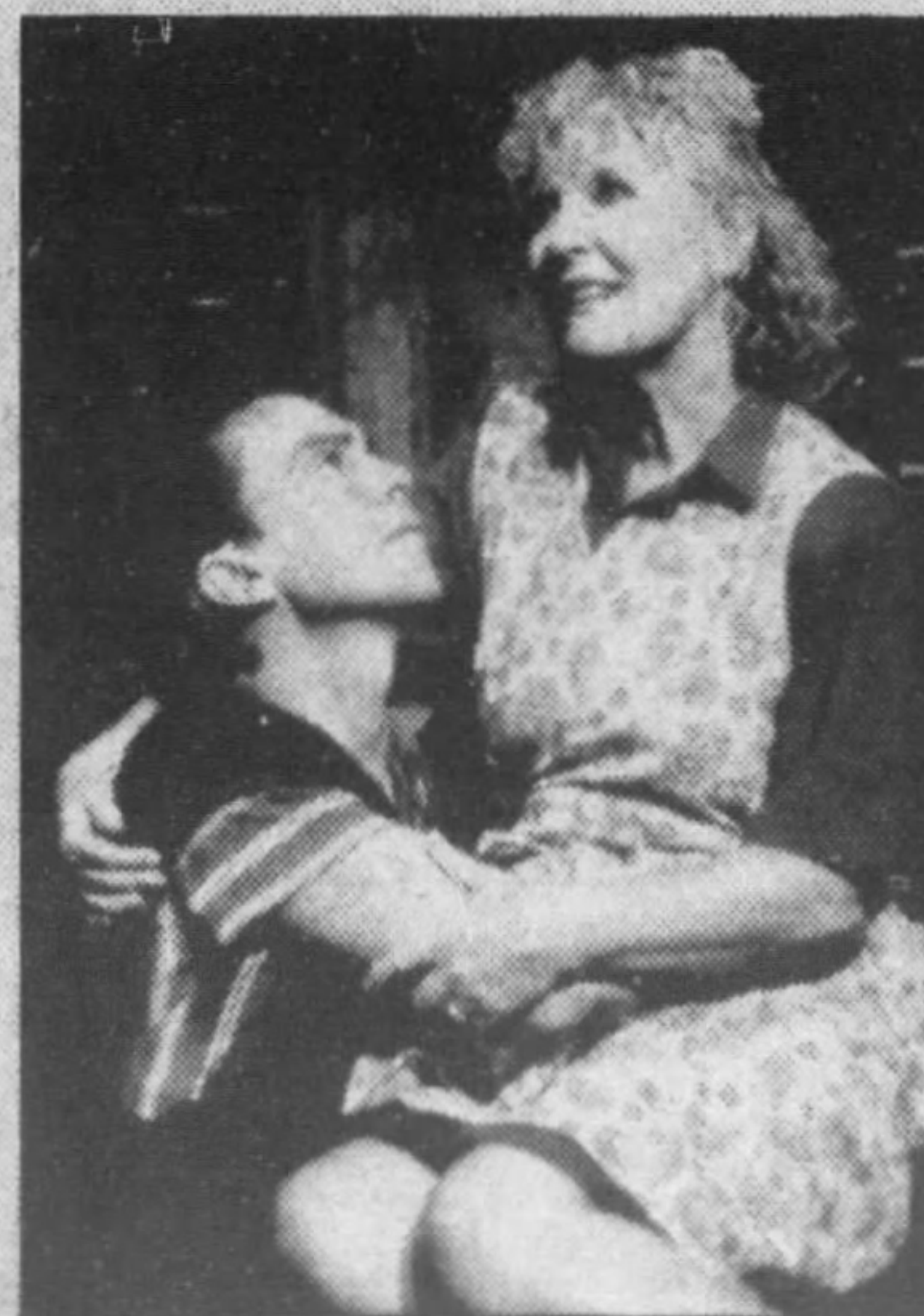
David Cassidy and Petula Clark are friends as well as co-stars.