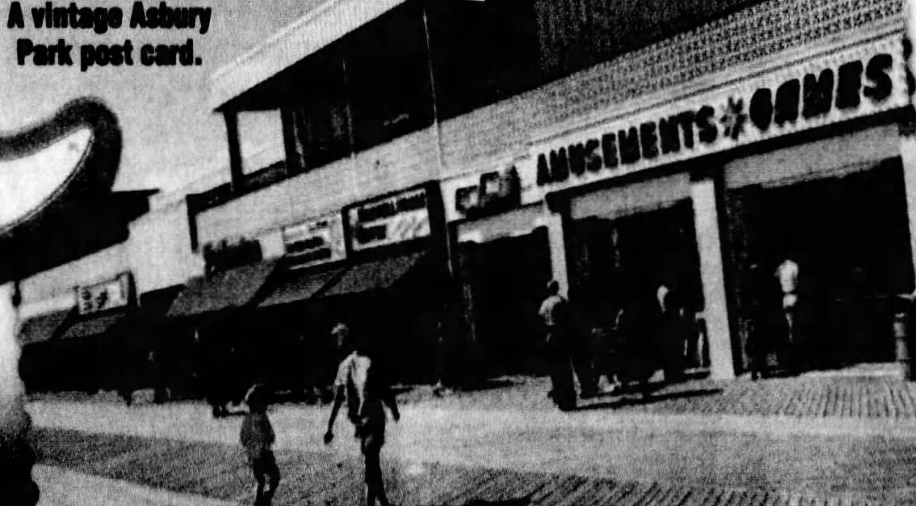
A vintage Asbury Park post card.