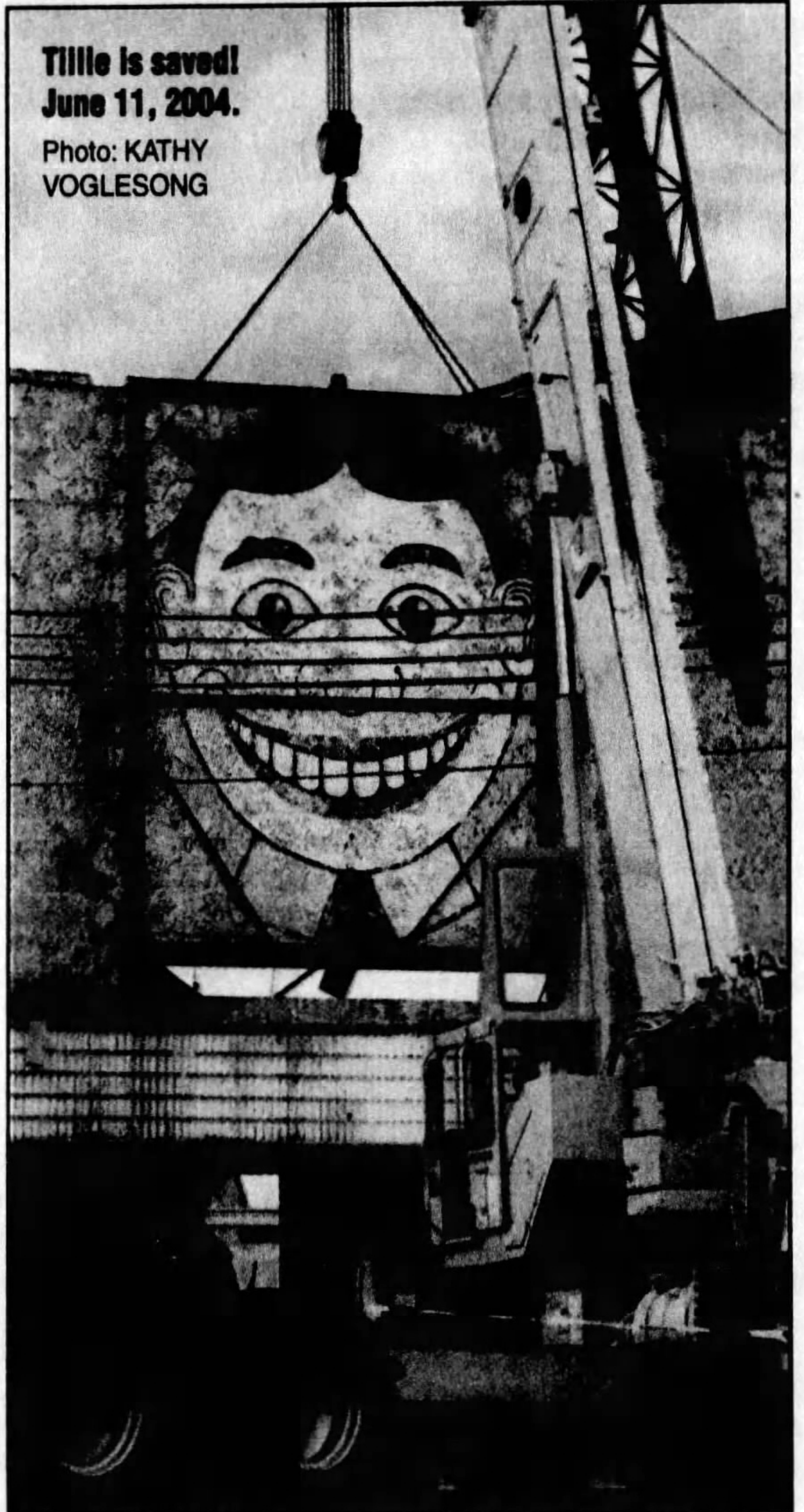
Tillie is saved! June 11, 2004.

But I took my son to West Orange; I drove by the house I grew up in. I took him all through New Jersey, but we didn't get to Asbury Park. There's a part of me that doesn't want to go back there, because I don't want to see what happened to it. You know? I want to preserve the memory of what it was for me. But you've tweaked my interest. Tell me a little more about that clown face (laughs).